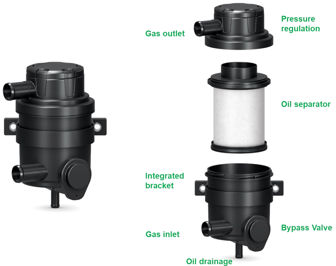
Figure 1: ProVent 2 200 system

ProVent 2 200 systems are designed for both original equipment and retrofit. The following illustrations show possible superstructures and a cross-section of the system.